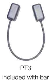
PT3 included with bar